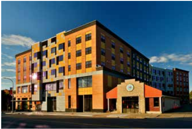
Swinburne Apartments has space for a health care facility, nonprofit services, a blood lab, grocery store and other retail businesses.

All three phases have the same goals: returning vacant properties into productive use and providing residents with safe, quality housing.