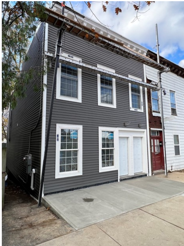
Rehabilitation of a vacant property acquired from the Albany County Land Bank underway in Albany, New York.