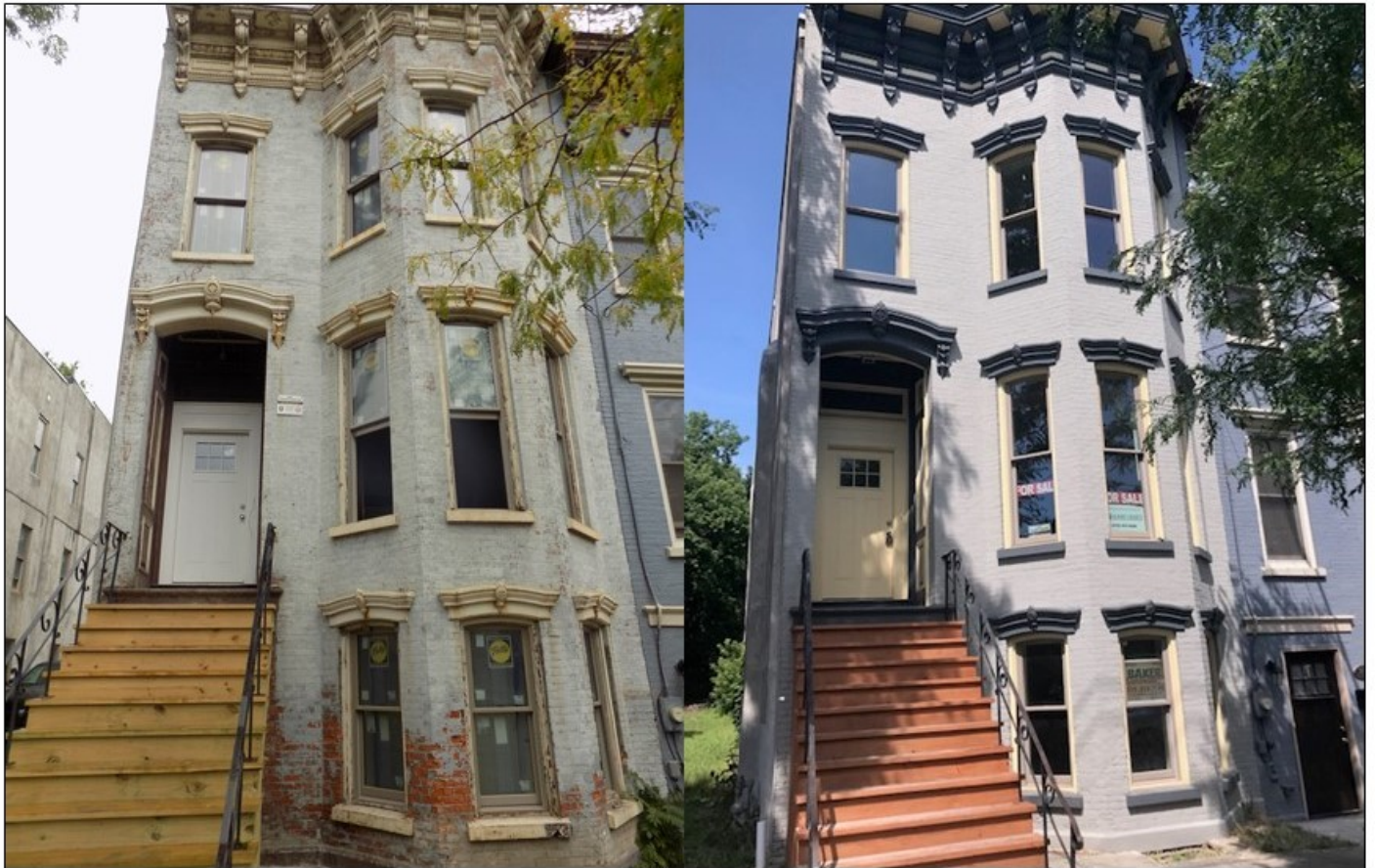
Before and after of a rehabilitated Albany County Land Bank property on Clinton Avenue in the City of Albany